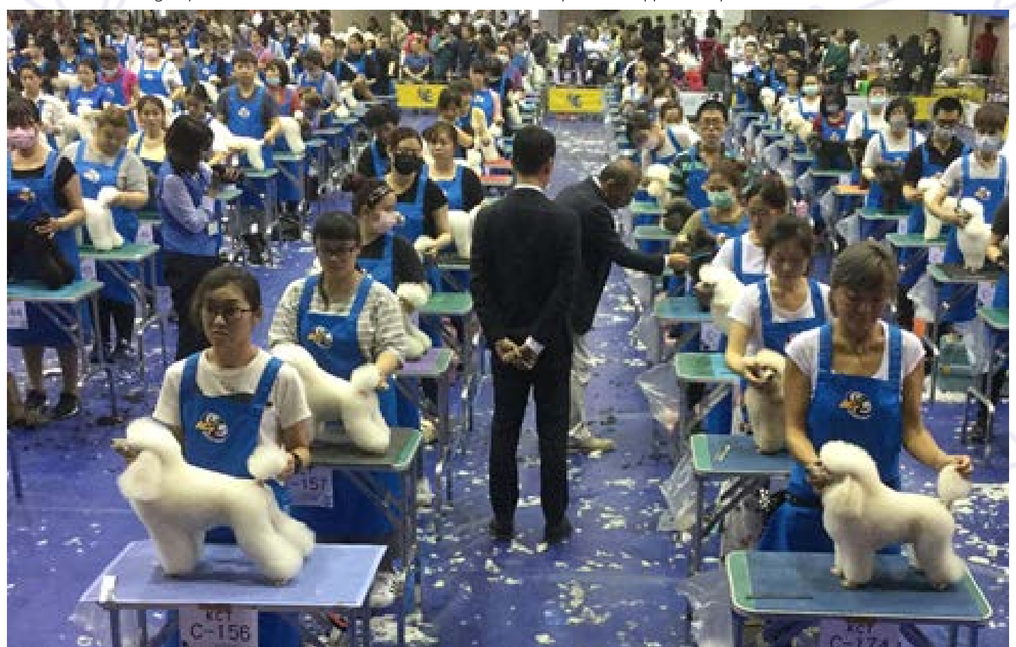
The C-class examinees must pose their model dogs (finished or unfinished) at the end of the designated grooming period for the examiner/judge to check the grooming of the dogs.

In the Taiwanese system, an individual may sign up for the Class C Examination with or without formal training from one of the recognized grooming schools. Since the test is an assessment test of skills, one only needs to show that he or she possesses the required skills of a C-class groomer during the examination. Of course, since the task has become so specialized, it is best to go through formal training with one of the schools. This training may last from four to six months and the tuition fee may cost the applicant anywhere from NT $ 1,500 to NT$ 2,500.