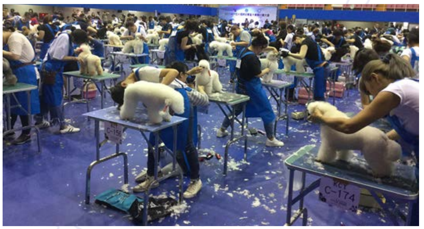
Once the signal is given, examinees must work as fast and as precisely as they could to make the grade.

In the Taiwanese system, an individual may sign up for the Class C Examination with or without formal training from one of the recognized grooming schools. Since the test is an assessment test of skills, one only needs to show that he or she possesses the required skills of a C-class groomer during the examination. Of course, since the task has become so specialized, it is best to go through formal training with one of the schools. This training may last from four to six months and the tuition fee may cost the applicant anywhere from NT $ 1,500 to NT$ 2,500.