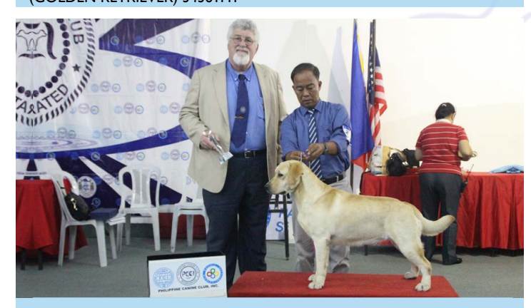
BEST JUNIOR IN SHOW HIGH STREET UNICORN (LABRADOR RETRIEVER) 7892011