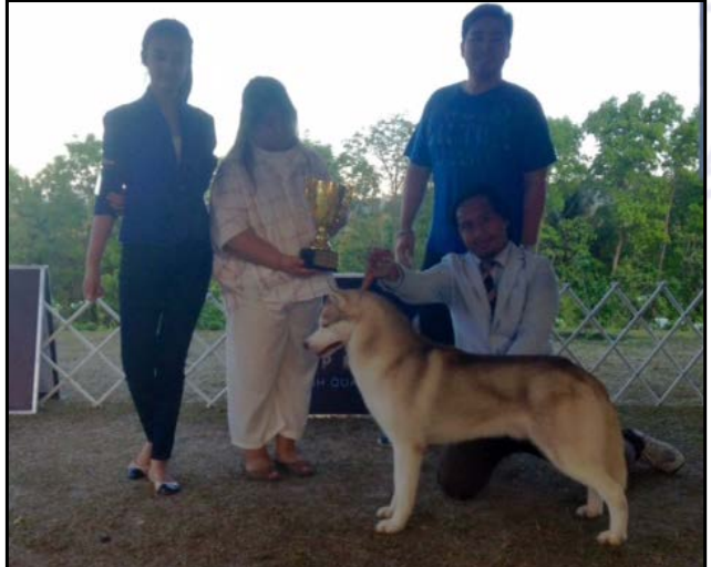
189th Best in Show - Siberian Husky - Phil Kor Ch Snowy Hills Only One Golden Age Thor (KOR)