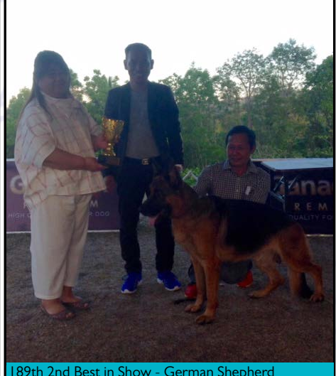
189th 2nd Best in Show - German Shepherd Dog, Phil Gr Ch Boss Di Casa Massarelli, Italy