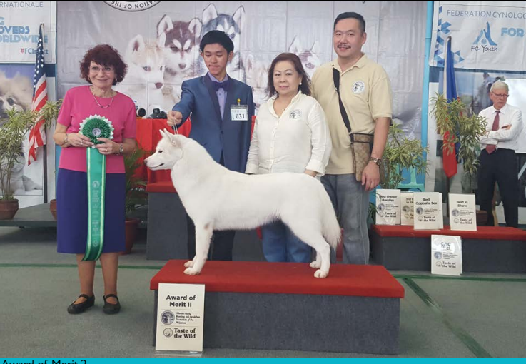
Award of Merit 2 Phil CH Topaz Get Off My Cloud

Best in Show: Beagle; Ph HOF/ APAC Gr/ AM/ GRG/ KOR Ch/ PW '17 Honey Pot Bee in Love With Me (USA)