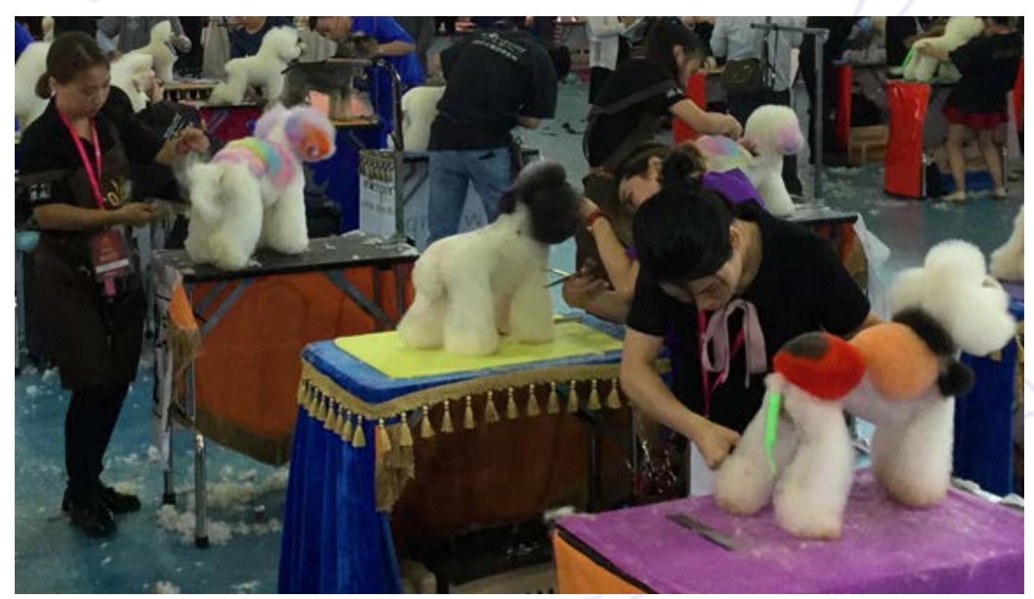
The creative or free-style category in an international grooming competition highlights the trimming and dyeing expertise of the groomers.