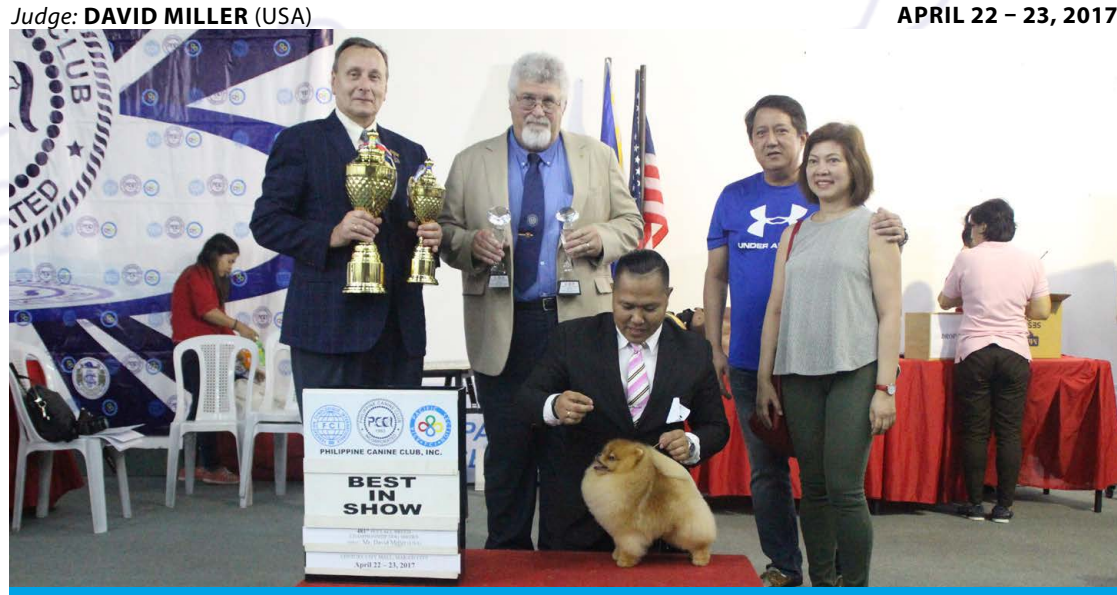
BEST IN SHOW & BEST PHIL-BORN IN SHOW PHIL HOF/JR CH/PW16/PW17 SUN VALLEY ONE DIRECTION (POMERANIAN) 43677L5

481<sup>ST</sup> PCCI CHAMPIONSHIP DOG SHOW