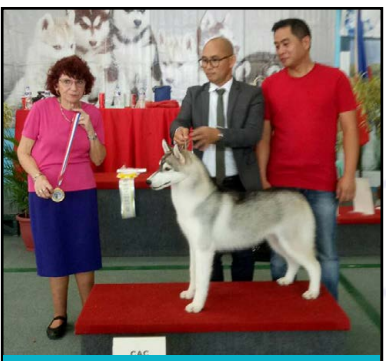
CAC Dog_Silver Avalon Prince Gray