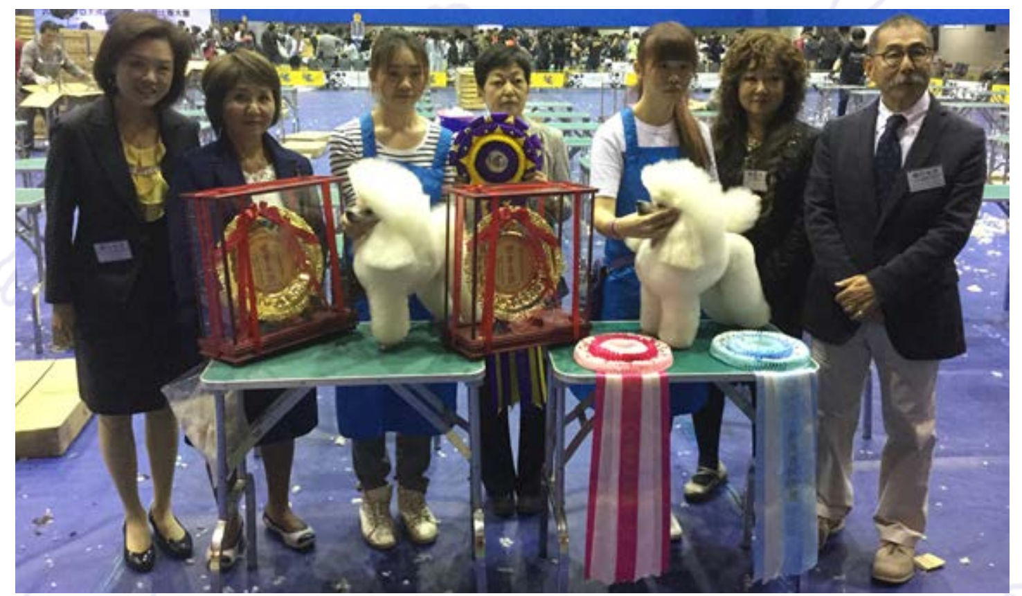
The top scoring examinees in the C-class and B- Class in one of the annual examination/competitions in Taiwan with their trophies, ribbons, model dogs and the four Japanese grooming masters who served as examinees/competition judges