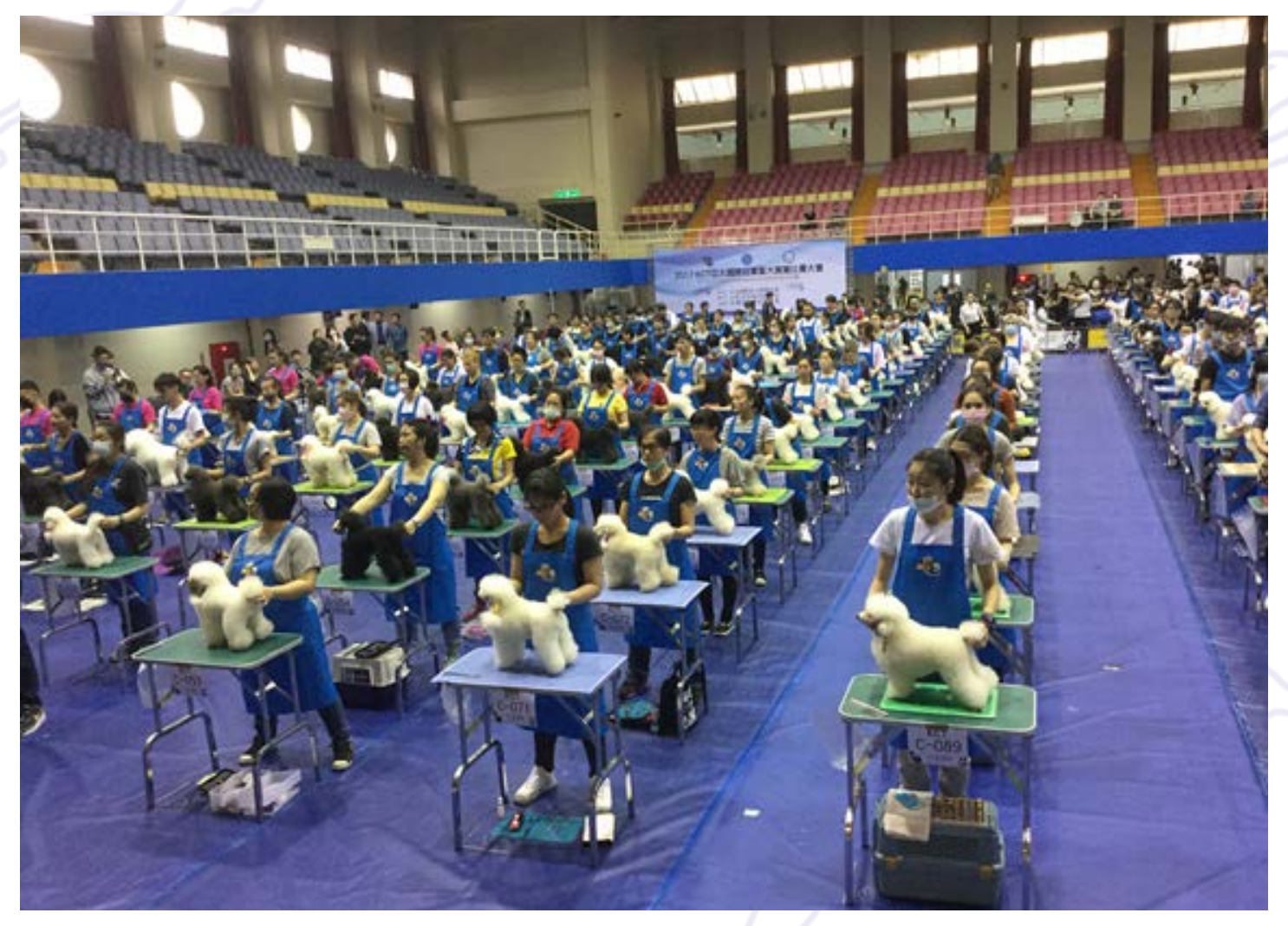
Examinees pose with their ungroomed model dogs before the start of the examination. Poodles and Bichon Frises are the acceptable model dogs.

Must pass two breeds, no formal classes offered Certification Fee: US$ 390 + US$130 (Examination Fee plus certificate issuance fee in case the applicant passes the examination)