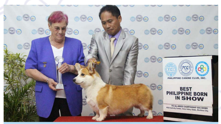
BEST PHIL-BORN IN SHOW PHIL GR/JR CH MADISONS QUEST ARIA STARCK (WELSH CORGI - PEMBROKE) 0615ZB3

PHIL HOF/TH/APAC/SEA CH/PW'17 DESTINY'S FLASH FIRE (USA) (CHIHUAHUA - SMOOTH COAT) 58580B5 Owner/s: PAUL MARVIN GUTIERREZ Breeder/s: L BOWES