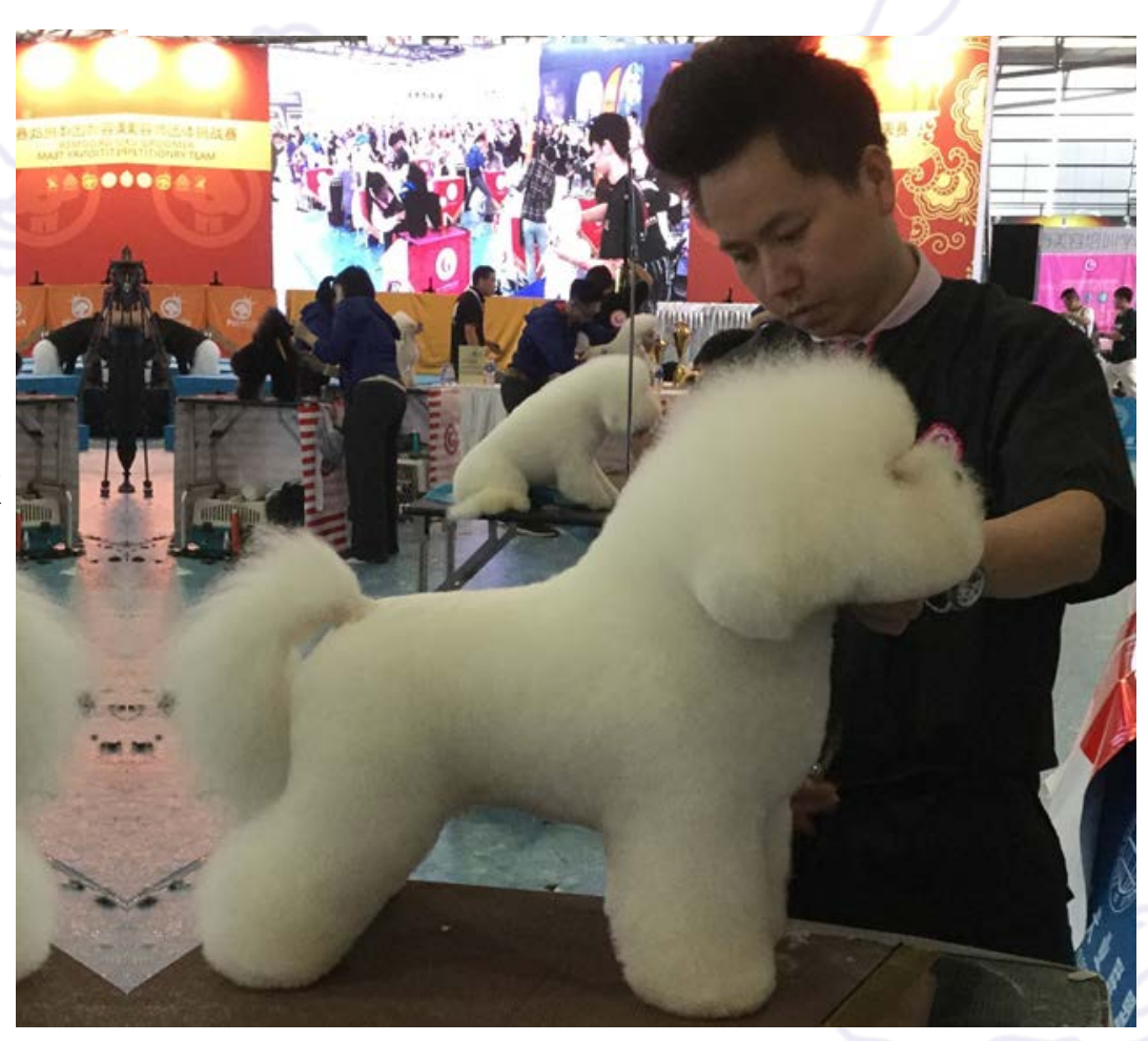
A Bichon Frise almost ready to step into the ring

Is the Philippines ready for grooming competitions?