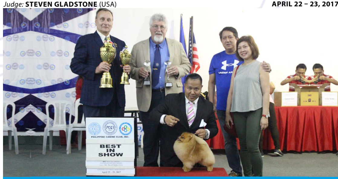
BEST IN SHOW & BEST PHIL-BORN IN SHOW PHIL HOF/JR CH/PW'16/PW'17 SUN VALLEY ONE DIRECTION (POMERANIAN) 43677L5

480<sup>TH</sup> PCCI CHAMPIONSHIP DOGSHOW