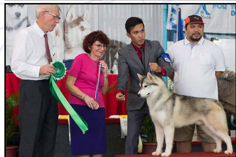
Award of Merit 3 & Select Dog - Phil ch White Land Exelero