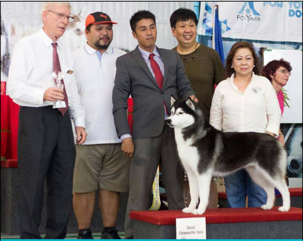
Best of Opposite Sex In Specialty Show -Phil Gr Ch Danaya of Doghouse Farm

Best Baby Puppy in Show: Alaskan Malamute; Pacifique's I Can Do That (Imp in Dam)