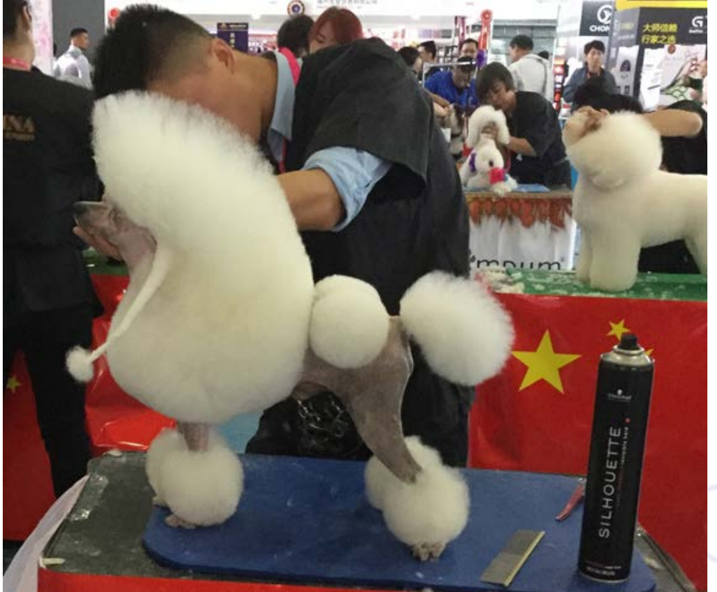
A hopeful contestant in an international grooming competition with his miniature poodle almost done to perfection

Once a groomer gets his C-class certificate, he or she can already start preparing for the B-class certification and if he or she passes this, move onwards to earn an A-class license. Those who would like to teach grooming professionally or would like to start a grooming school, will have to work on getting a Trainer/Teacher Certificate.