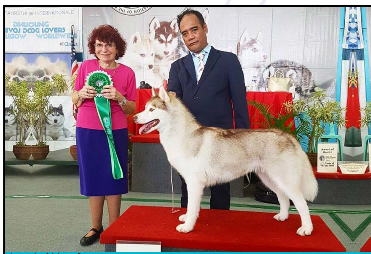
ward of Merit 3 Phil HOF Int Sup NZ Ch Alyeshka Tickled Pink