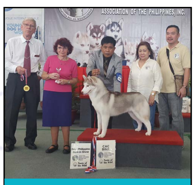
CAC Bitch_Grandis Ninja Princess