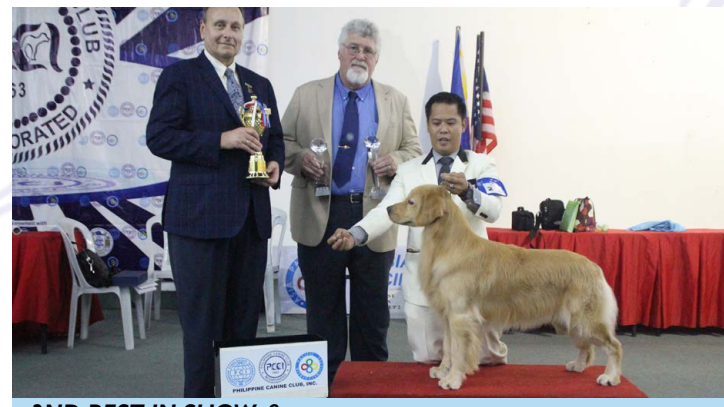
2ND BEST IN SHOW & 2ND BEST PHIL-BORN IN SHOW PHIL CH CBEAR AURIC STYLE (GOLDEN RETRIEVER) 34361H1