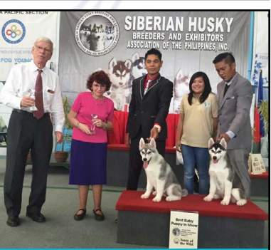
Best Baby Puppy in Specialty Show -Bleeker St Poison Ivy and Bleeker St Harley Quinn