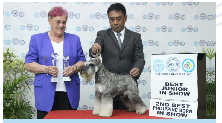
BEST JUNIOR IN SHOW DECANUS DIPLOMATIC AFFAIRS (MINIATURE SCHNAUZER - SALT & PEPPER) 7027N4

Owner/s & Breeder/s: ERNEST OPPEN, & MA. NIEVES SAN DIEGO