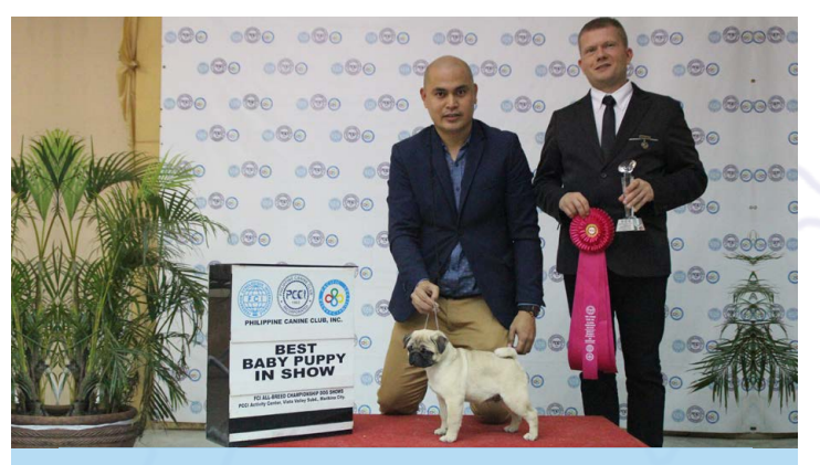
BEST BABY PUPPY IN SHOW WETASKIWIN'S STRIKE EAGLE (PUG)

Owner/s: ARCH SUSAN POLICARPIO-FABIAN Breeder/s: S O.V.