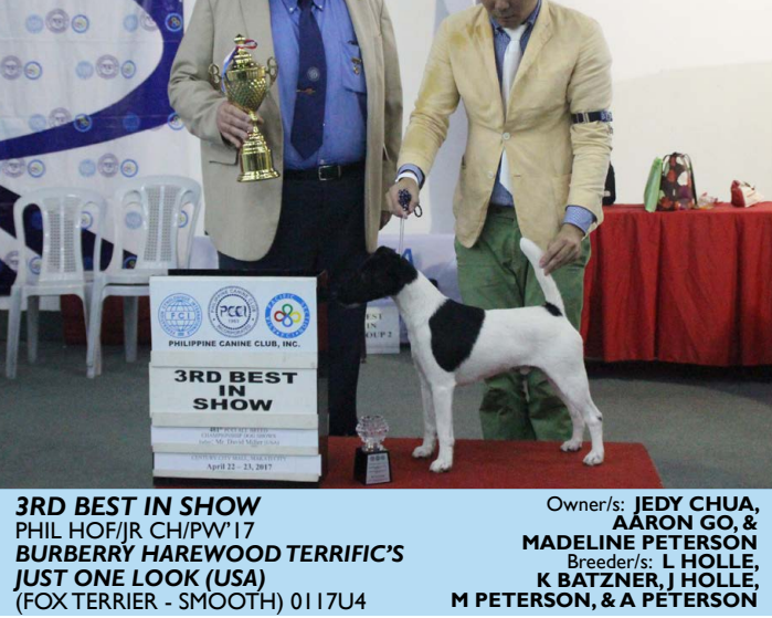
JUST ONE LOOK (USA) (FOX TERRIER - SMOOTH) 0117U4

BEST PUPPY IN SHOW NORWOOD BH TEQUILA BRANDY (BEAGLE) 39366D2 Breeder/s & Owner/s: CONSTANTINE ARNALDOZY DOZON